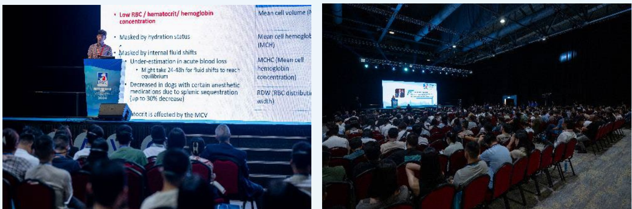
Industry experts provide world-class education at IAVC 2024.