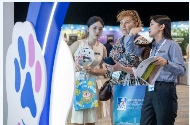
Attendees mingle with exhibitors on the show floor of IAVC 2024, discovering cutting-edge products and technologies that advance veterinary care and pet wellness.

In addition to the conference sessions, the exhibition hall showcases a wide array of products and technologies that enhance veterinary practices and pet care. Attendees are encouraged to explore the show floor to discover the latest innovations and establish valuable connections with industry leaders.